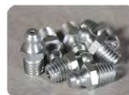
Pressing nipple for shutter connector