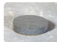
Rubber plate for shutter connector